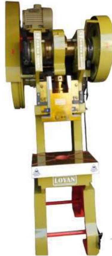
Loyan -30 Ton