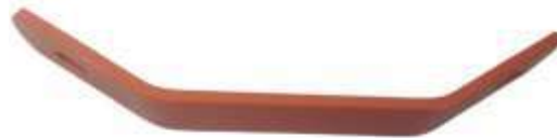
Vice Skid Semi+