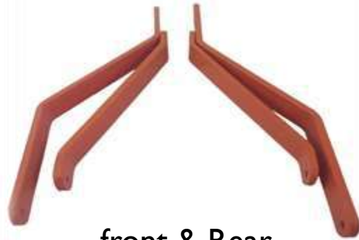
front & Rear Support